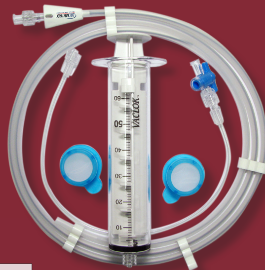
Aspiration Catheter Set

The Biometrix Thrombus Aspiration Catheter incorporates a smooth tip design to increase pushability and a unique hydrophilic coating to escalate trackability. The Aspicath's excellent pushability is also due to the innovative shaft design and the kink resistance, specifically designed for aspiration catheters.